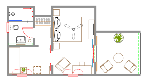
*2 layouts available for the Comfort Family rooms