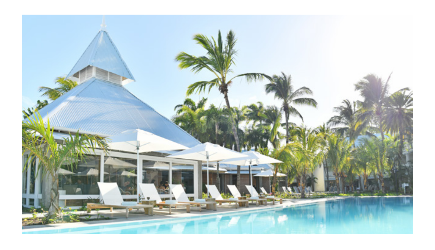
Veranda Grand Baie